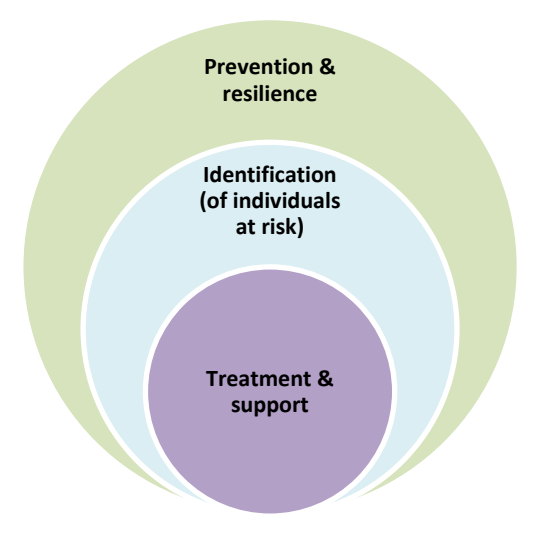
Figure 1. A Framework for the Delivery of the Sexual and Reproductive Health Improvement Plan

Southampton is a modern, attractive city where people are proud to live and work – Sexual health services which provide the right support, in the right place at the right time and pro-actively supports vulnerable communities, can support the City's image of a confident, modern, bustling City with a dynamic social and night time economy, and in which its Citizens are empowered to live the lives they want. Good sexual health services and effective access to birth control will help ensure that Southampton is a city that people are proud to live in.